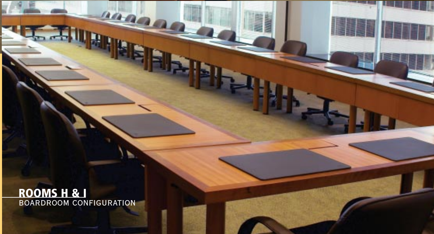
ROOMS H & I BOARDROOM CONFIGURATION